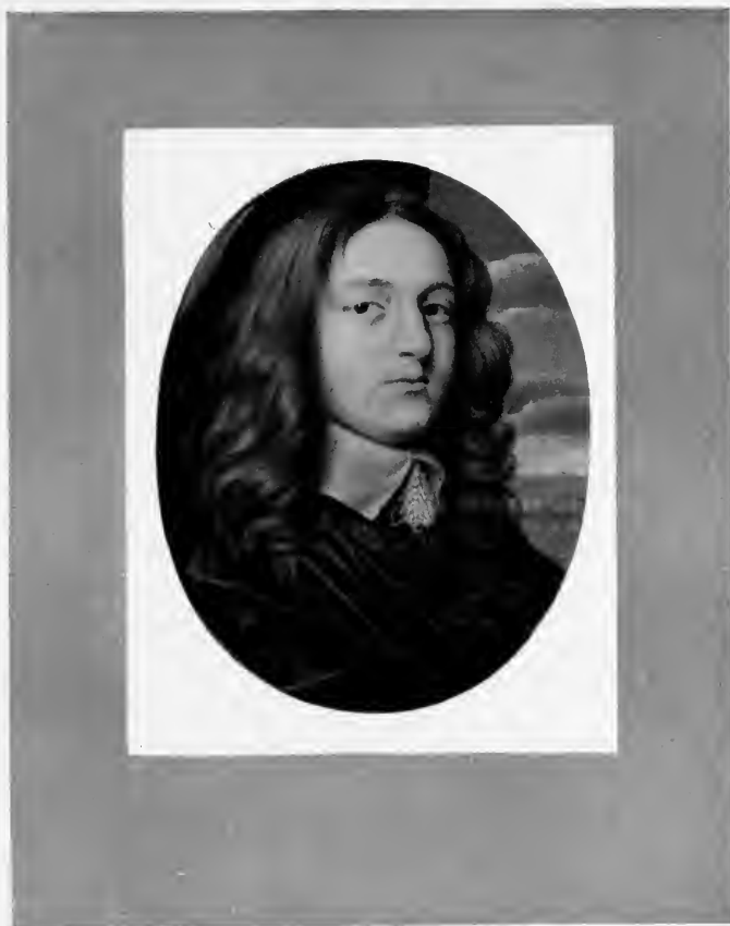
THE DUKE OF BUCKINGHAM BY JOHN HOSKINS, THE ELDER